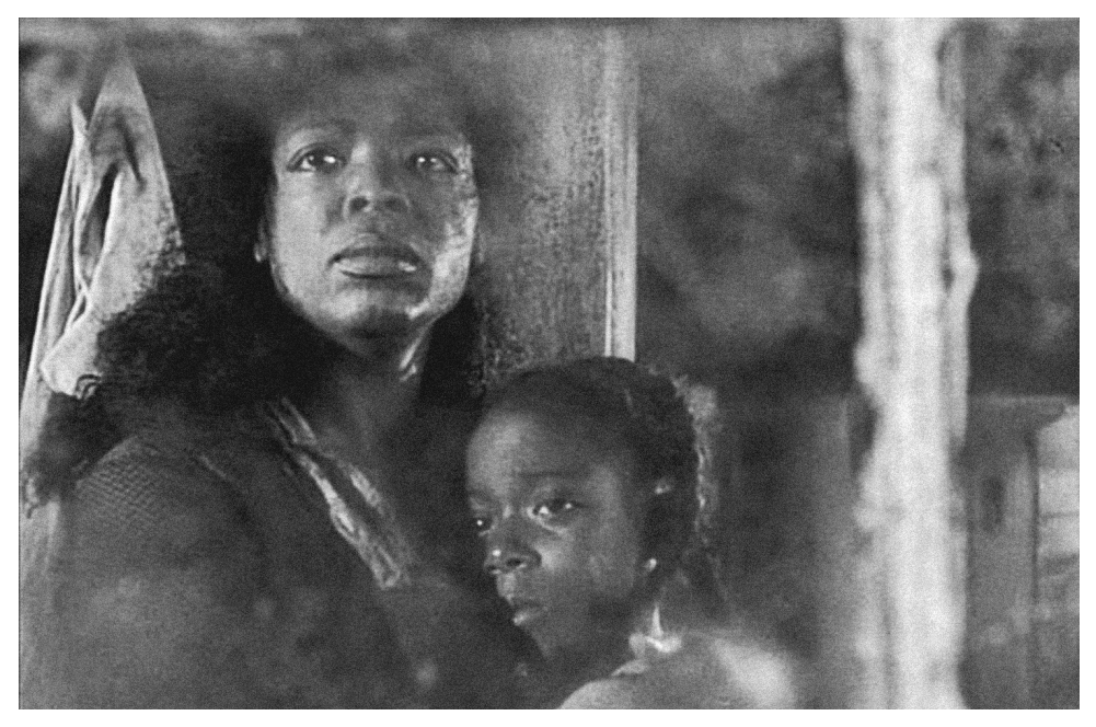
Figure 1.2: Film adaptation starring Oprah Winfrey as Sethe and Kimberly Elise as Denver

too and what is down there. The rest is weather. Not the breath of the disremembered and unaccounted for, but wind in the eaves, or spring ice thawing too quickly. Just weather. Certainly no clamor for a kiss. Beloved."<sup>14</sup>