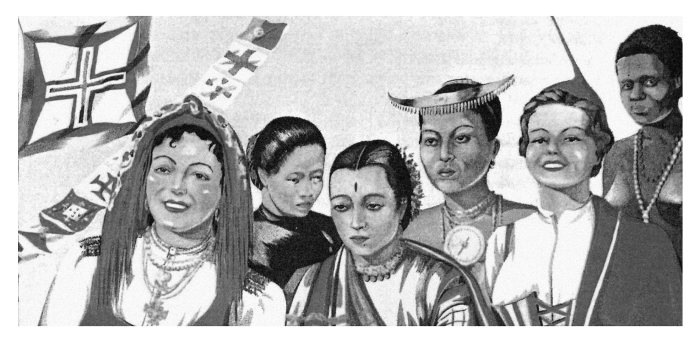
Figure 5.2: Illustration from the Estado Novo school textbook for the 4th grade, 1965

the idea of a unified Portugal, both in the metropolis and in the colonies, as we can see in the example of the illustration above (see Figure 5.2).